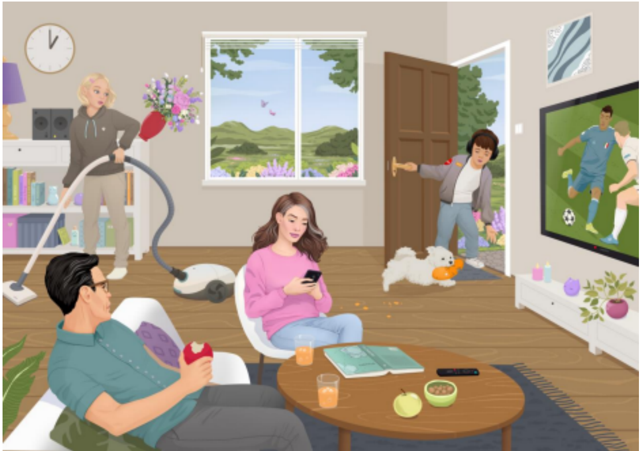
Figure 1: 'Slipper Thief' scene. Participants are asked to describe this scene during an encoding trial, and then asked to recall the scene without presentation of the stimulus after ~ 30 minutes.